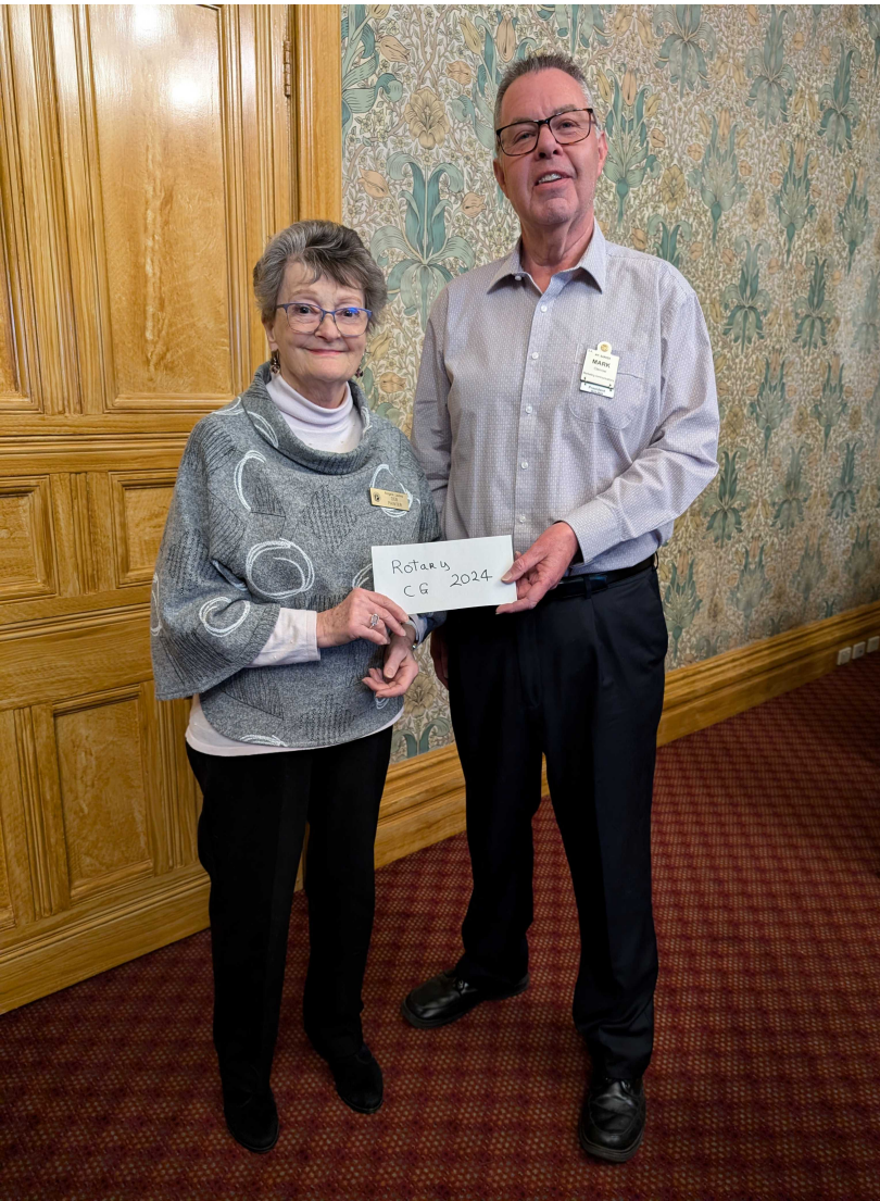
Hahndorf Community Assoc