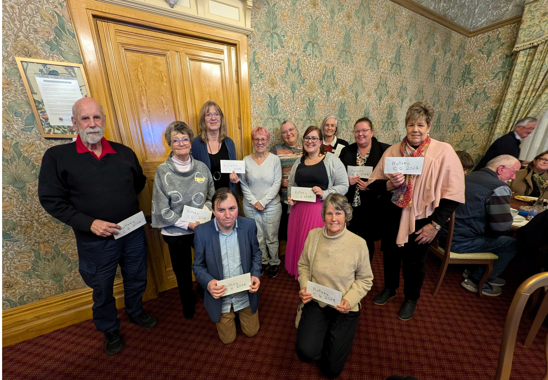
RECIPIENTS OF 2024 COMMUNITY GRANTS