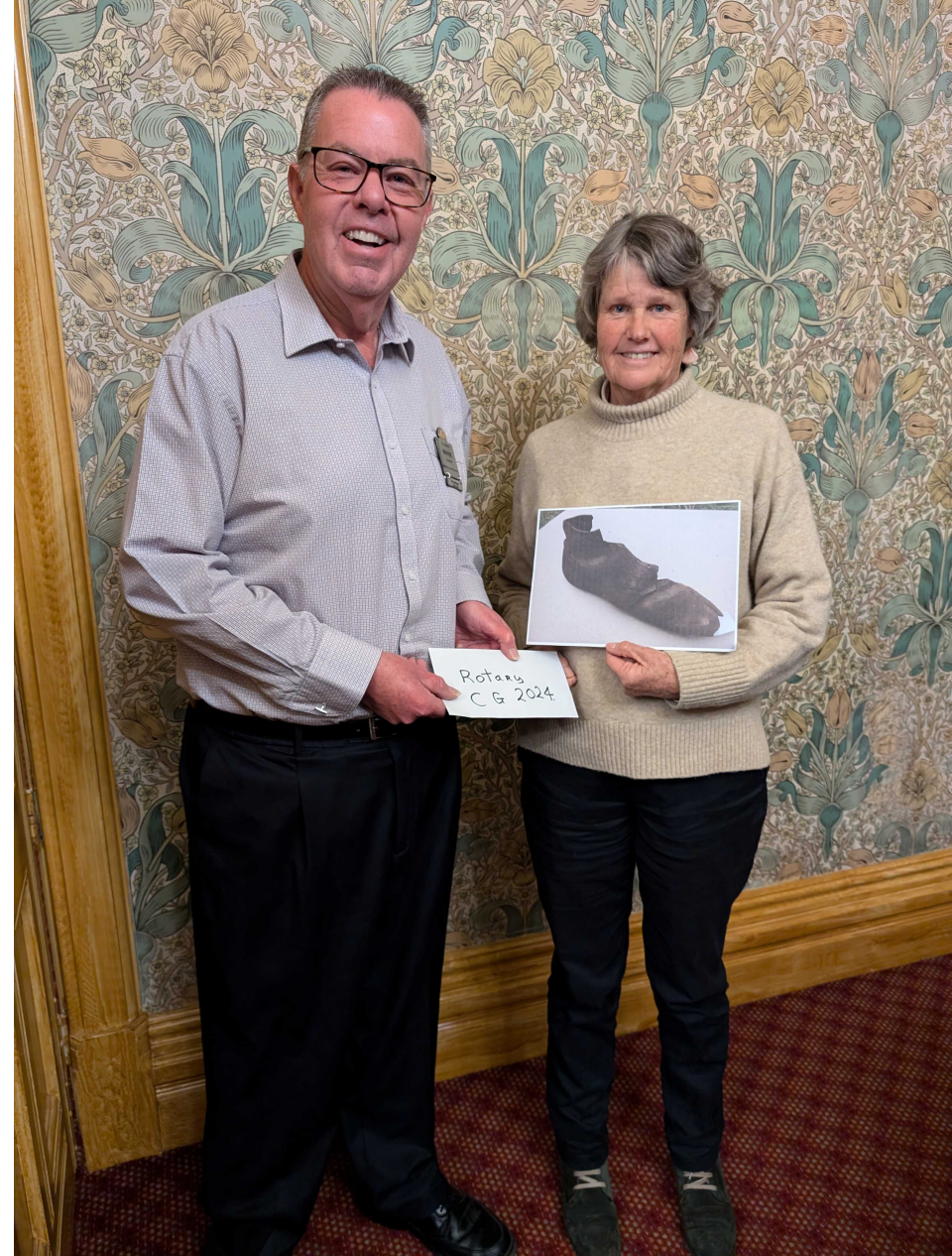
Mt Barker Church of Christ