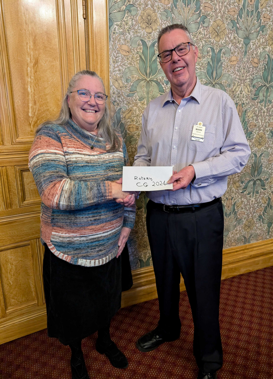
Macclesfield Community Assoc