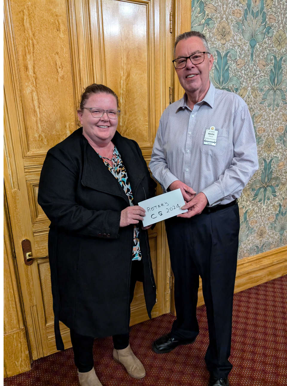
Oakbank Area School