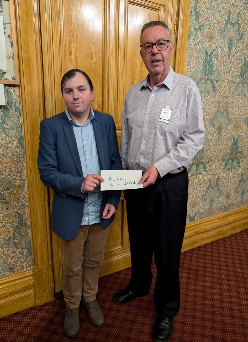
Circle of Friends