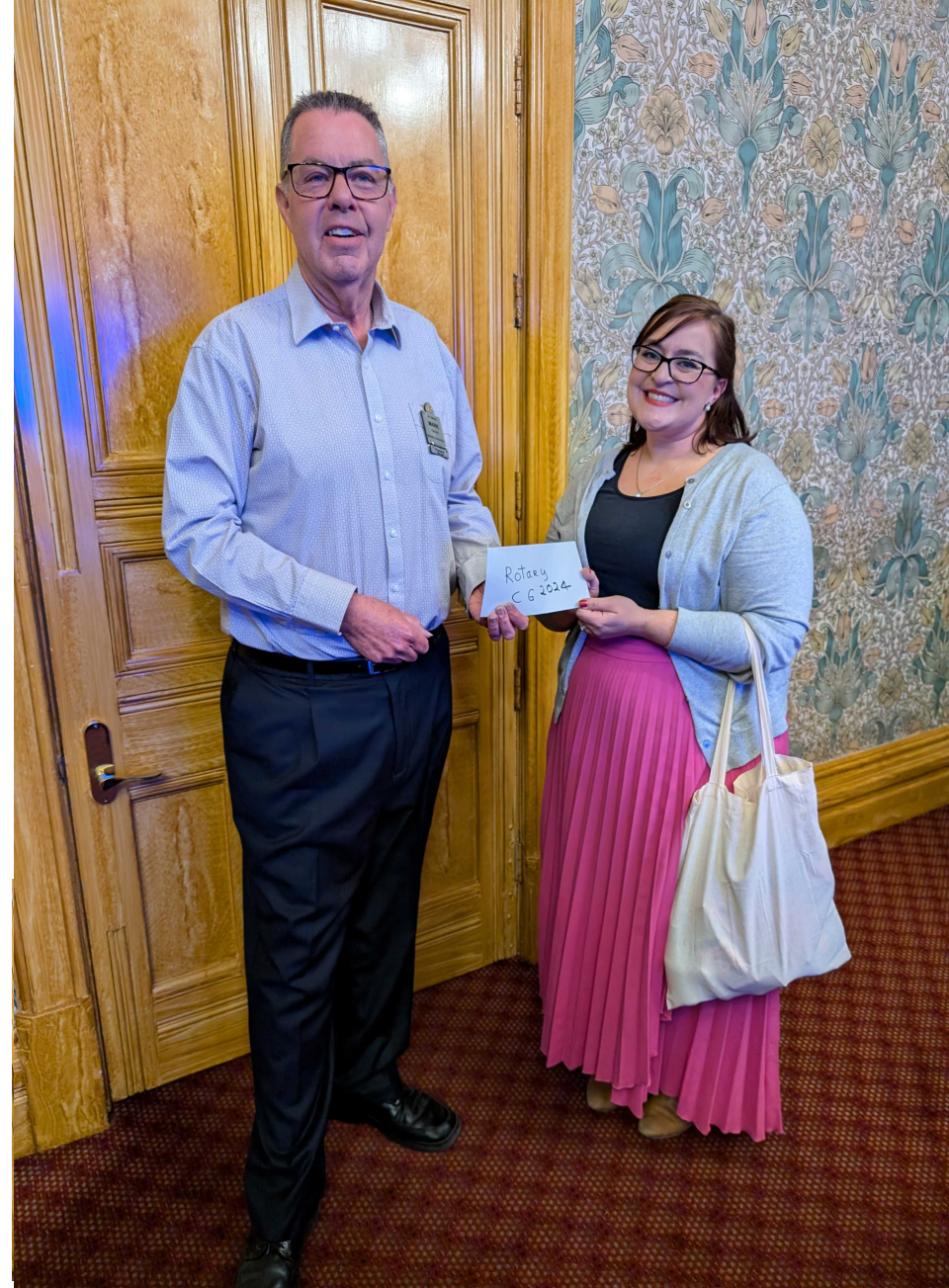
Shoe Boxes of Love