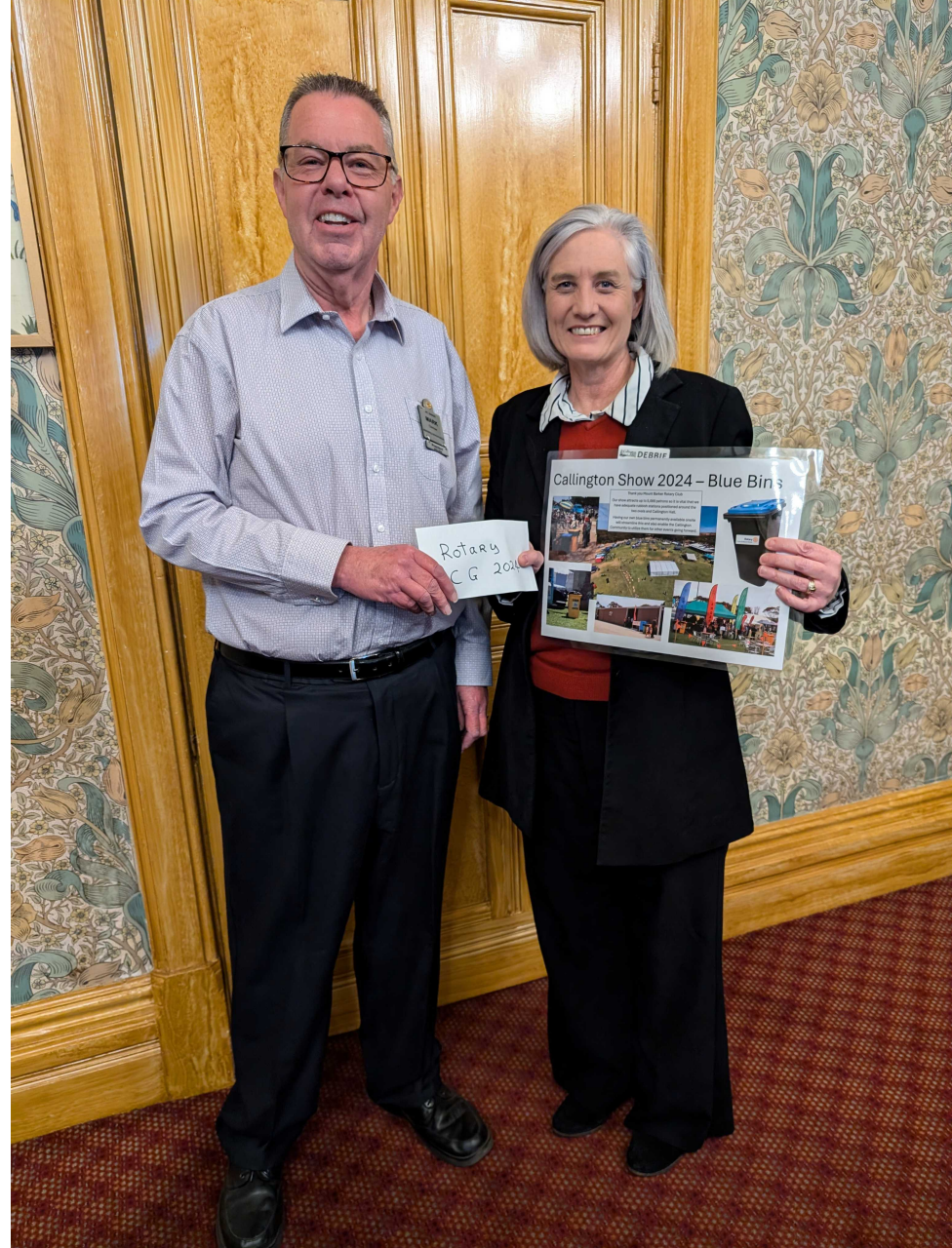
Callington A&H Show Society